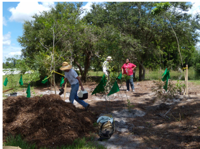
Team Coccoloba getting the job done last summer at Estero Community Park.